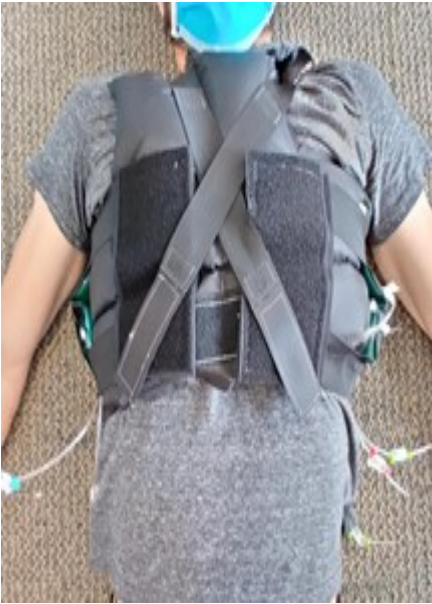
Early prototype of Georgia Tech's V/Q Vest designed to treat acute respiratory distress syndrome