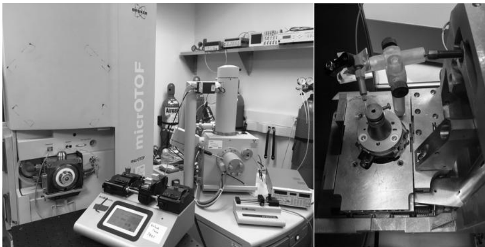
Image shows a mass spectrometer and scanning electronic microscope that provide the foundation for the BeamMap system, which can simultaneously determine surface topology and chemical makeup of a biological sample.