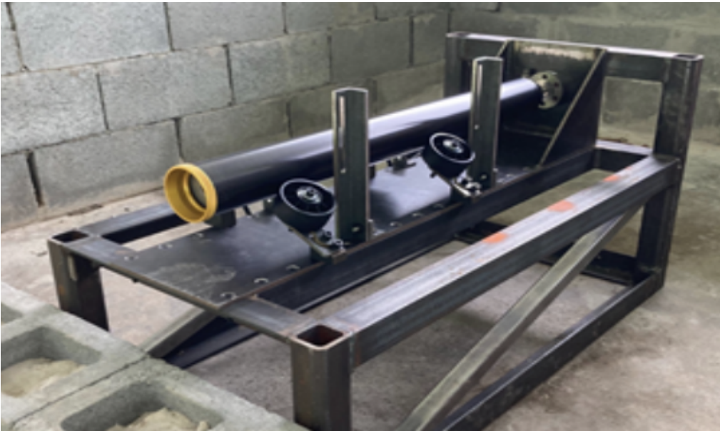
Georgia Tech's hot-fire test facility.