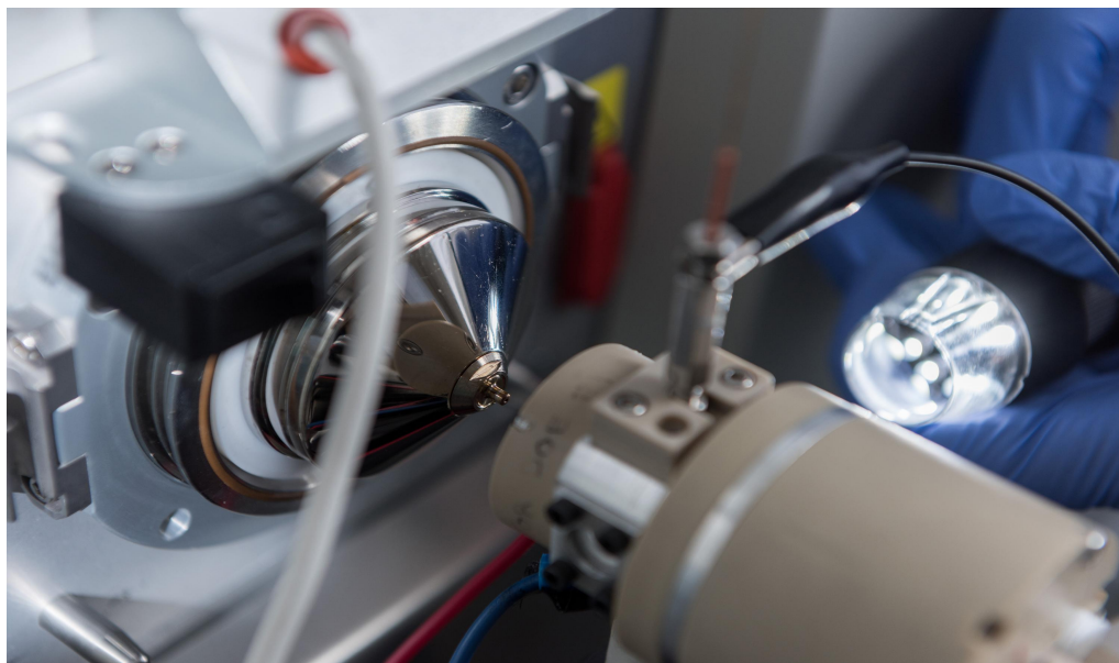
The DRILL device connected to a mass spectrometer in the Georgia Tech lab

Visit the Technology here: Advancing Mass Spectrometry with Novel Interface